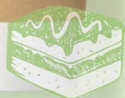
STARBUCKS® CLASSIC COFFEE CAKE & ALMOND MILK LATTE (16 OZ. GRANDE)